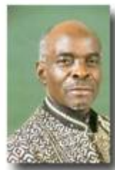
Prime Minister Nahas ANGULA