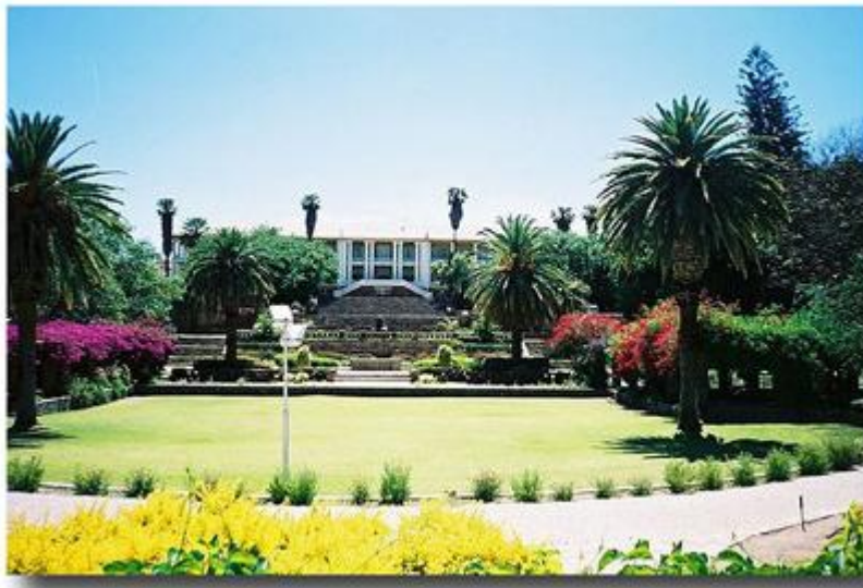
Namibia's House of Parliament in Windhoek

Bicameral legislature consists of the National Assembly (72 seats; members are elected by popular vote to serve five-year terms) and the National Council (26 seats; two members are chosen from each regional council to serve six year terms) . The National Assembly is headed by the Speaker . The National Council is headed by a Chairman.